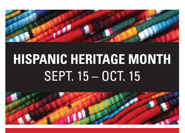
Bradley Creek Elementary will hold its annual Hispanic Resource Fair on October 15 from 6 pm - 8 pm